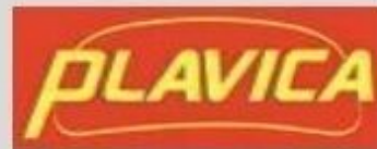
Plavica VEN C.A Ciudades: Maracay, Pto. Ordaz, Punto Fijo, Maracaibo, Maturin, Pto. La Cruz, Valencia - Venezuela