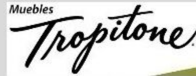
Muebles Externi C.A Ciudades: Guarenas, Valencia, Pto. La Cruz y Caracas - Venezuela