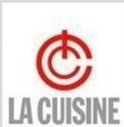
La Cuisine Gourmet Ciudad de Caracas Venezuela